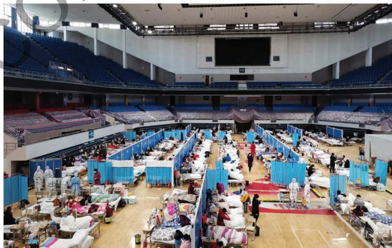
Fig. 2. Bird's eye view of Wuchang temporary COVID-19 specialty Ark Hospital.

Staffing wise, the ratio is 10 physicians and 40 nurses for every 100 patients in the Ark Hospital to ensure timely care of our patients (fig. 4). Our goal is to have zero infection for healthcare providers, zero in-hospital deaths among admitted patients, and zero readmission for discharged patients. It is important to clarify that our Ark Hospital only admits