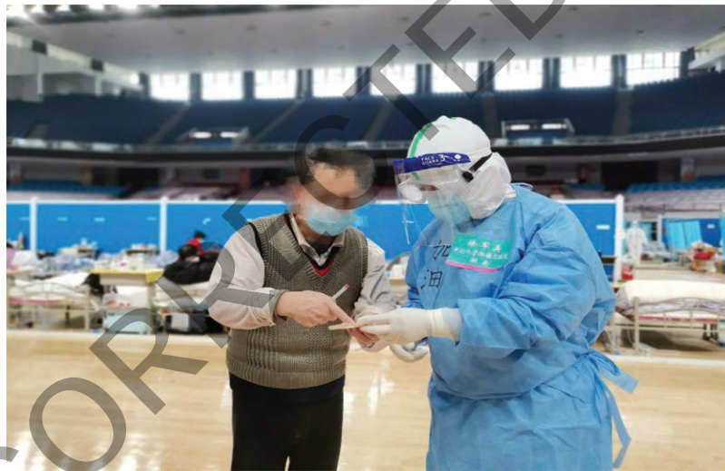
Fig. 4. Rounding on COVID-19 patients in Wuchang Ark Hospital.

patients with mild COVID-19 symptoms; patients with severe diseases are transferred to comprehensive hospitals.