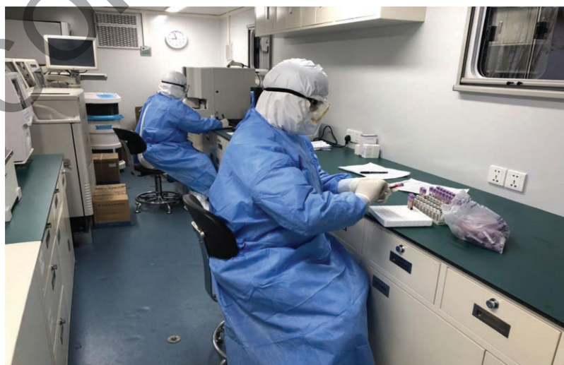
Fig. 5. Laboratory testing for novel coronavirus by physicians and technicians in the Screening/Testing Ark.

A temporary COVID-19 specialty hospital model significantly improved the diagnosis, admission, isolation, and treatment