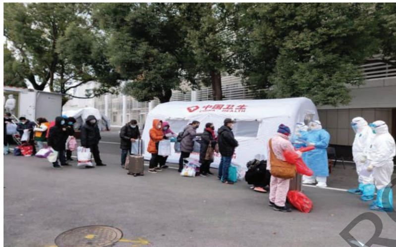
Fig. 3. Screening Ark in vehicles for Wuchang Ark Hospital.