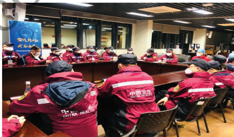
Fig. 1. A multidisciplinary meeting to discuss the operation of Wuchang temporary COVID-19 specialty Ark Hospital.

In creating these temporary hospital structures, we were guided by several design strategies, including the following.